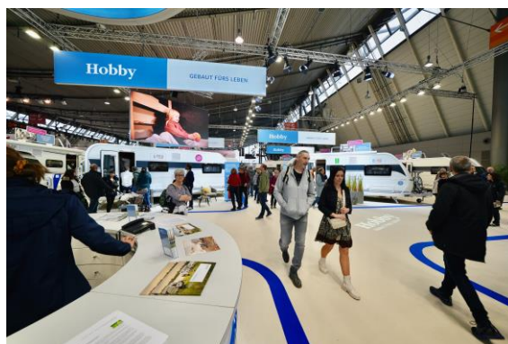
Many people visited the Hobby exhibition stand to find out about the company’s wide range of models

Hobby will next appear at the ABF exhibition in Hanover, which takes place from 1 to 5 February 2023, and the Reise & Camping trade fair in Essen, from 22 to 26 February 2023. Further information is available from the Hobby press office: presse@hobby-caravan.de or at mediaportal.hobby-caravan.de/en .