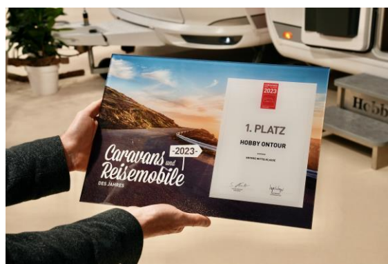
Presentation of the "Caravan of the Year" award to the ONTOUR model range

On the opening Saturday, Hobby was delighted when the ONTOUR model range was named the "Caravan of the Year" once again. In the "Motorhome of the Year" award, which was also voted for by the readers of Promobil and Caravanning magazines, the Optima Ontour Overcab took a very respectable third place.