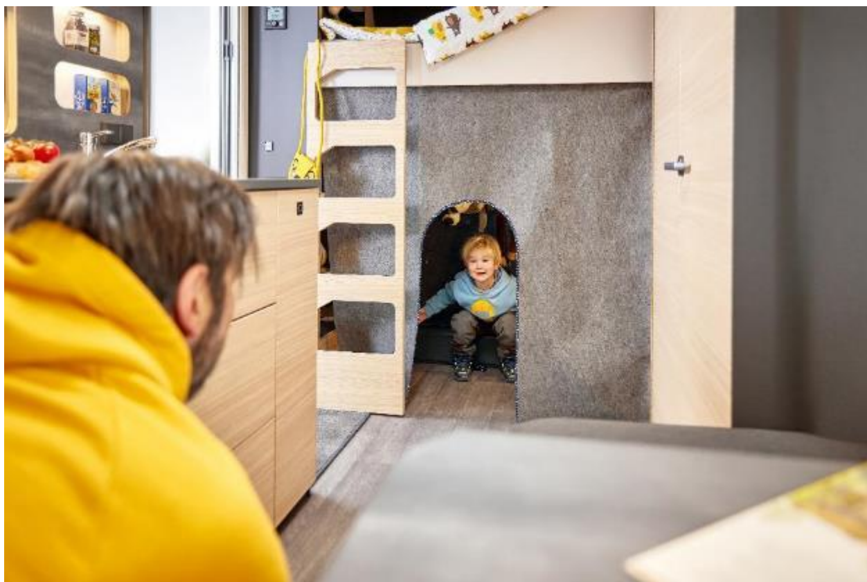
Daytime situation in the children's bed area of the MAXIA 595 KML

to the third, for when a friend comes along on holiday or when some of the kids stay at home, but the family dog joins the crew. And even without the bunk beds, the area can be used as flexible storage space. We're working on additional components for just that – such as shelving systems that, like all of our accessories, can easily be mounted on the wall.”