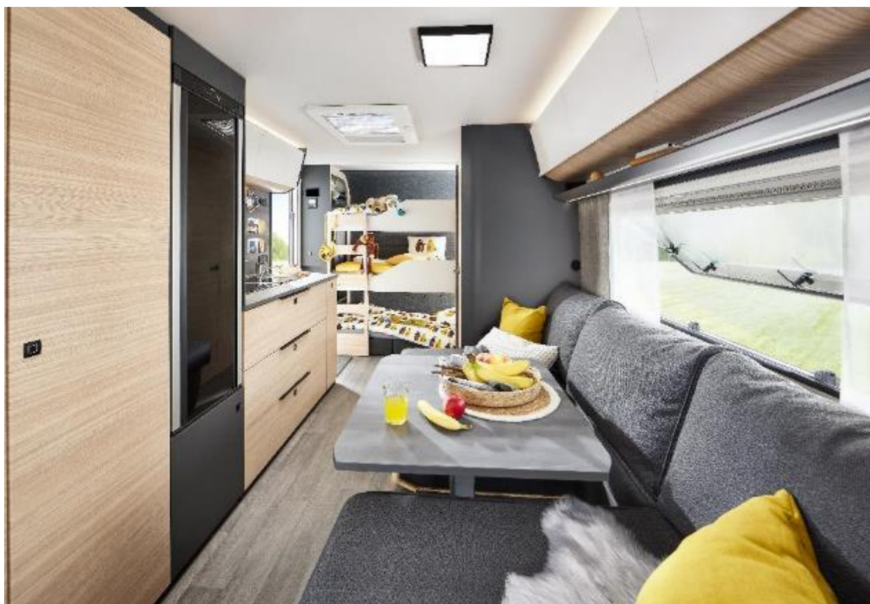
Rear view of the MAXIA 595 KML with the multifunctional children's bed area.

Thanks to a click-to-connect system with roll-up bed slats and mattresses, the comfortable upper beds that each measure 76 x 200 cm can easily be assembled and disassembled. The bottom bed is made up of three upholstered cushions and a topper to create a bed measuring 73 x 200 cm.