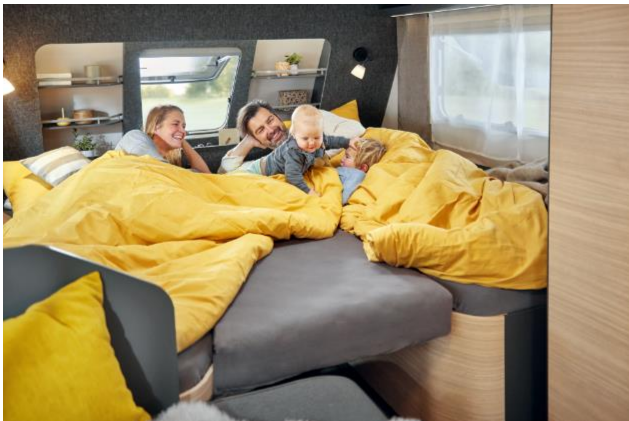
The cozy family bed with optional bed extension