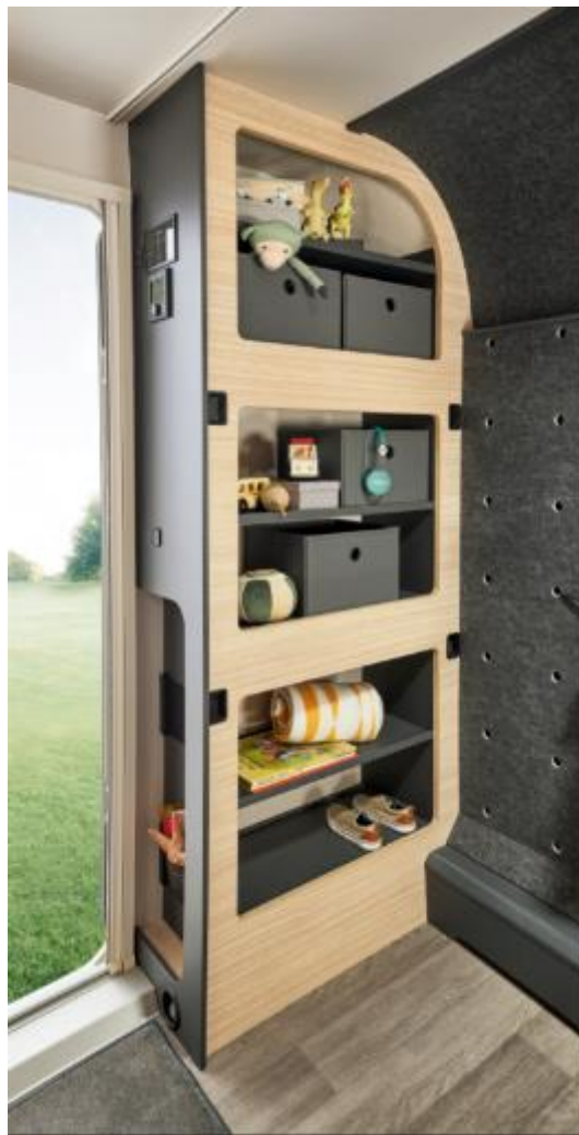
The multifunctional children's bed area of the MAXIA 595 KML

The removable ladder makes it easy and comfortable even for little feet to reach the upper beds. When the lower area is not being used as a bed or play area, the ladder serves as a guard to secure the luggage stored behind it. As an alternative, it offers a cosy retreat with a cushion for four-legged friends. "Multifunctional use is the fundamental idea behind the MAXIA 595 KML" explained Christoph Semkow, Project Manager of MAXIA development. "This caravan can be used by families for a lifetime. From the first child