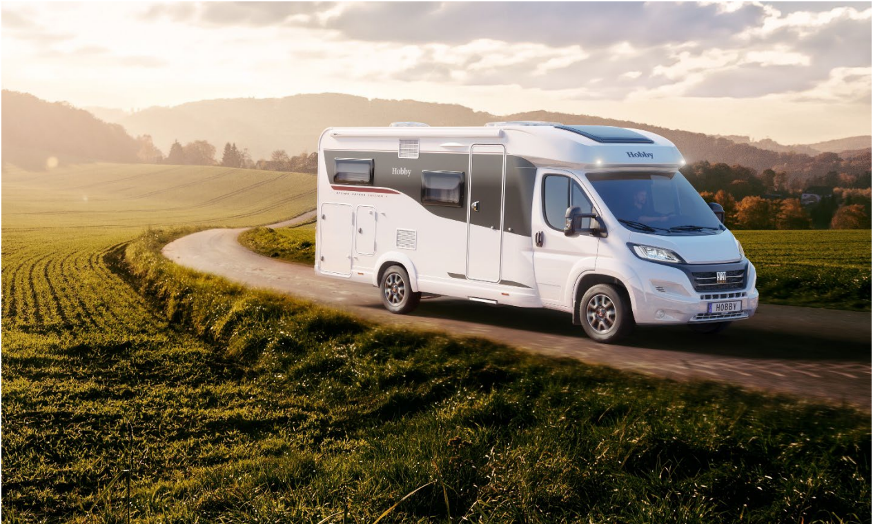
The OPTIMA ONTOUR EDITION F with new dynamic edition exterior panelling.

Fockbek, 12. January 2024 – A new year and a new limited special edition from Hobby: The compact OPTIMA ONTOUR EDITION F is built on a Fiat chassis and is ready for any adventure with the renowned “HobbyKomplett” ALL-INCLUSIVE package. However, as a special edition, it has even more to offer and comes with many extras worth over €11,000 included.