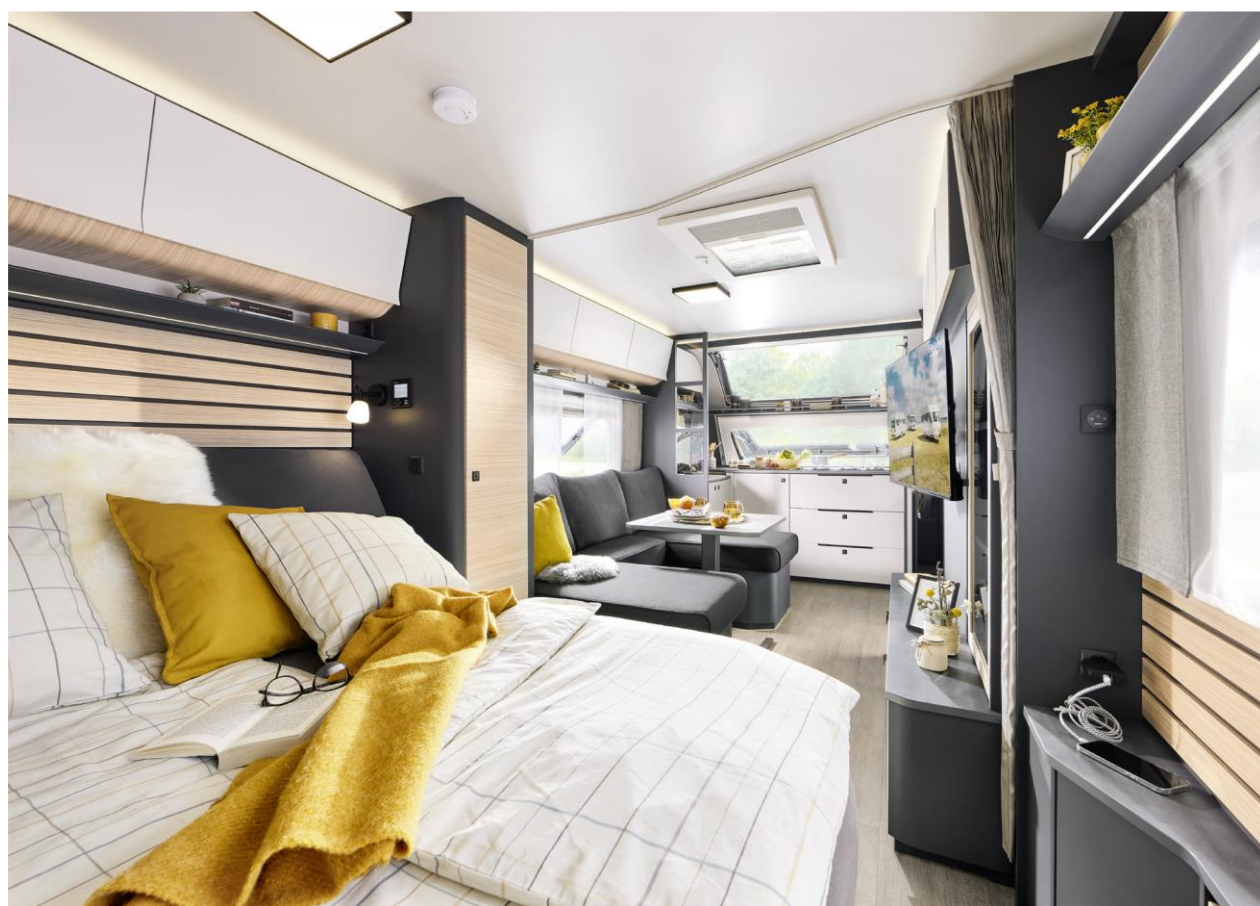
Camping with a luxury-apartment feel: the MAXIA 660 WQM

The spacious washroom and the colour-coordinated living and kitchen areas elevate this premium caravan to the next level. A highlight is the bright and airy front kitchen, complete with a 157-litre refrigerator and an expansive work surface. The large sofa with two chaises longues completes the perfect mobile living experience.