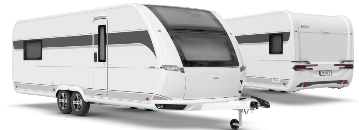
Exterior design of the MAXIA 660 WQM