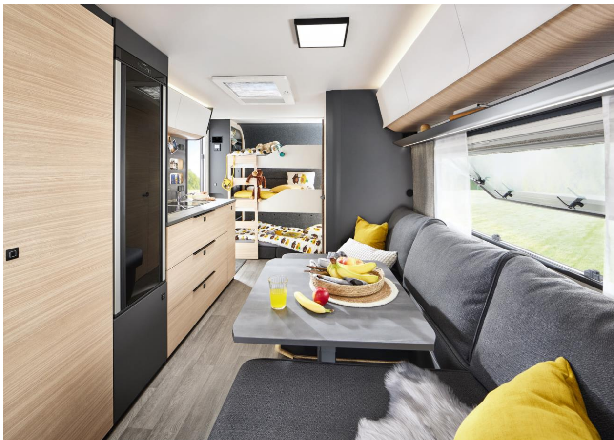
Everything a family needs for the road: the MAXIA 595 KML

The MAXIA 595 KML stands out with its unique multifunctional rear section that offers over nine different configurations. With just a few simple adjustments, you can set up or stow away up to three children's beds. The space also caters to the imaginative play of young campers, easily transforming into a play den, a children's seating area or a retreat for pets. Alternatively, it can be used as extra storage space for luggage. With up to seven berths, the 595 KML provides enough room for the whole family. The single beds can be expanded into a cosy family bed, and the central seating area and spacious kitchen ensure that everyone's needs are covered.