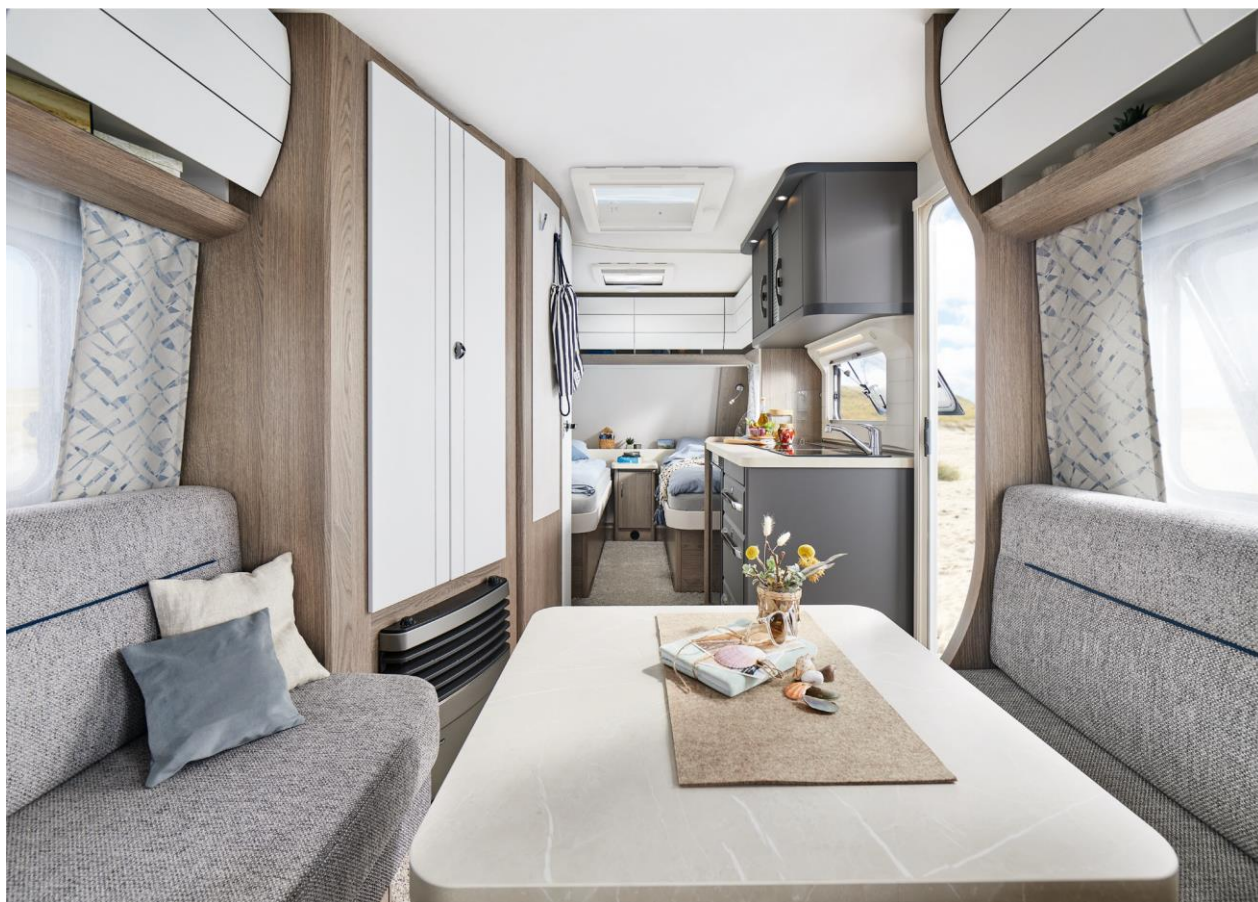
Fresh look in the ONTOUR 460 DL