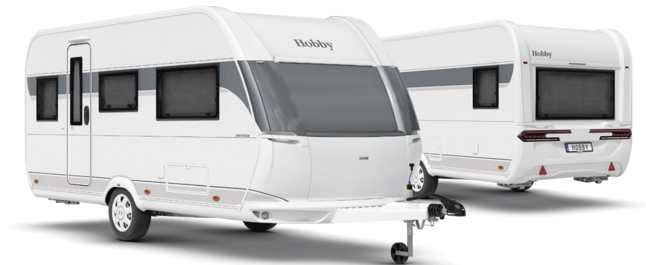
Exterior design of the ONTOUR 460 DL